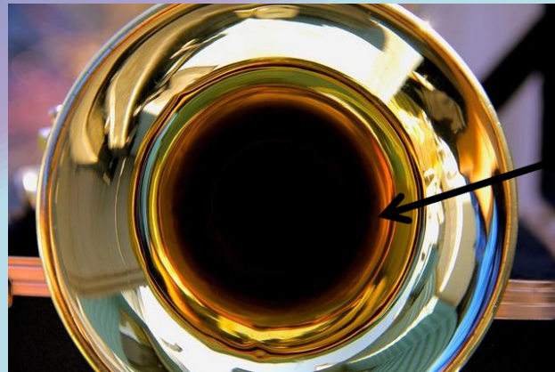
Bell of a trumpet