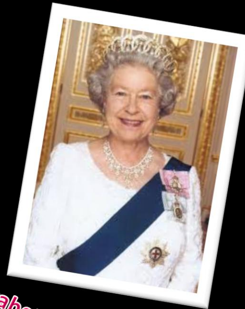
Queen Elizabeth 2