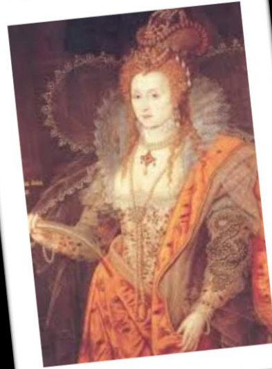
Queen Elizabeth 1