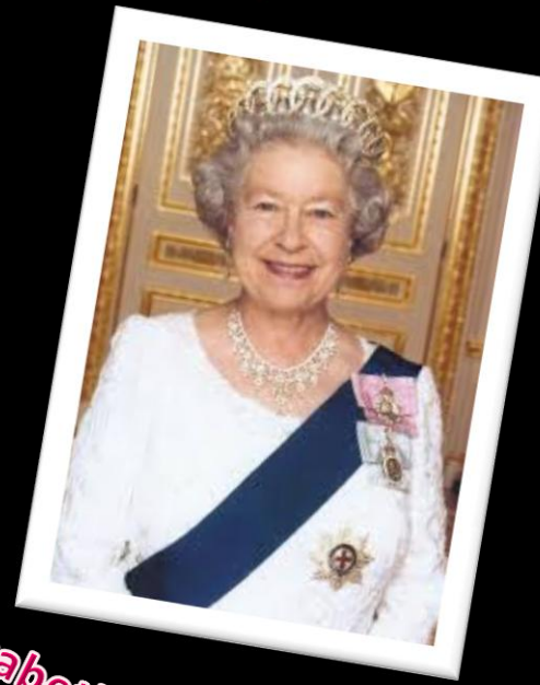
Queen Elizabeth 2