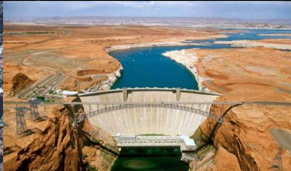
^ Glen-Canyon Dam ^ | |