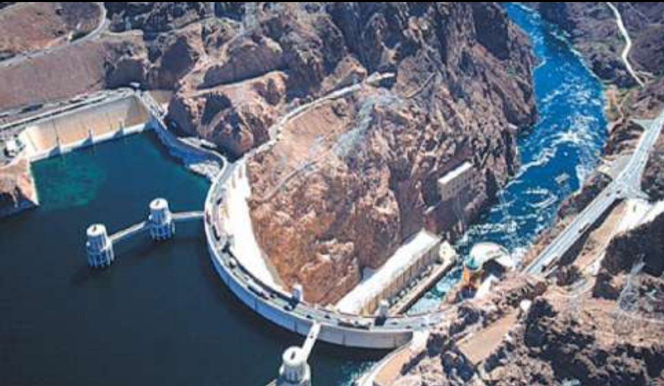
^ the Hoover Dam ^ | |

A barrier to obstruct the flow of water, usually built across streams or rivers. The word dam can be traced back to middle English and before that middle Dutch. Early dam building began in Mesopotamia in the middle east. Dams were used to control the water level, because Mesopotamia's weather was unpredictable and could cause flooding at any given moment. The earliest dam is the Jawa dam in Jordan, the structure is dated to 3000 B.C.